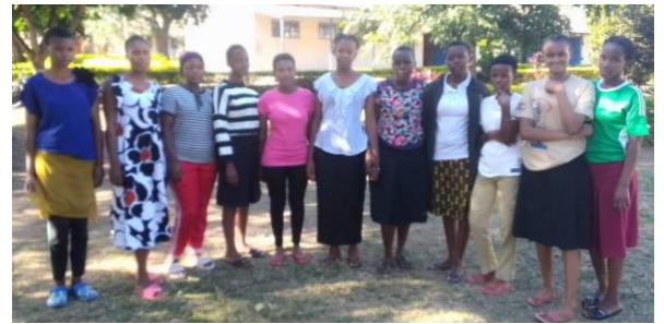
Current class of young mothers

See next page for 3 photos to choose from for the donate page!